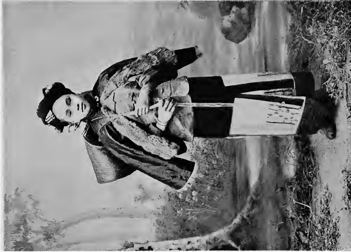
A Typical Shan